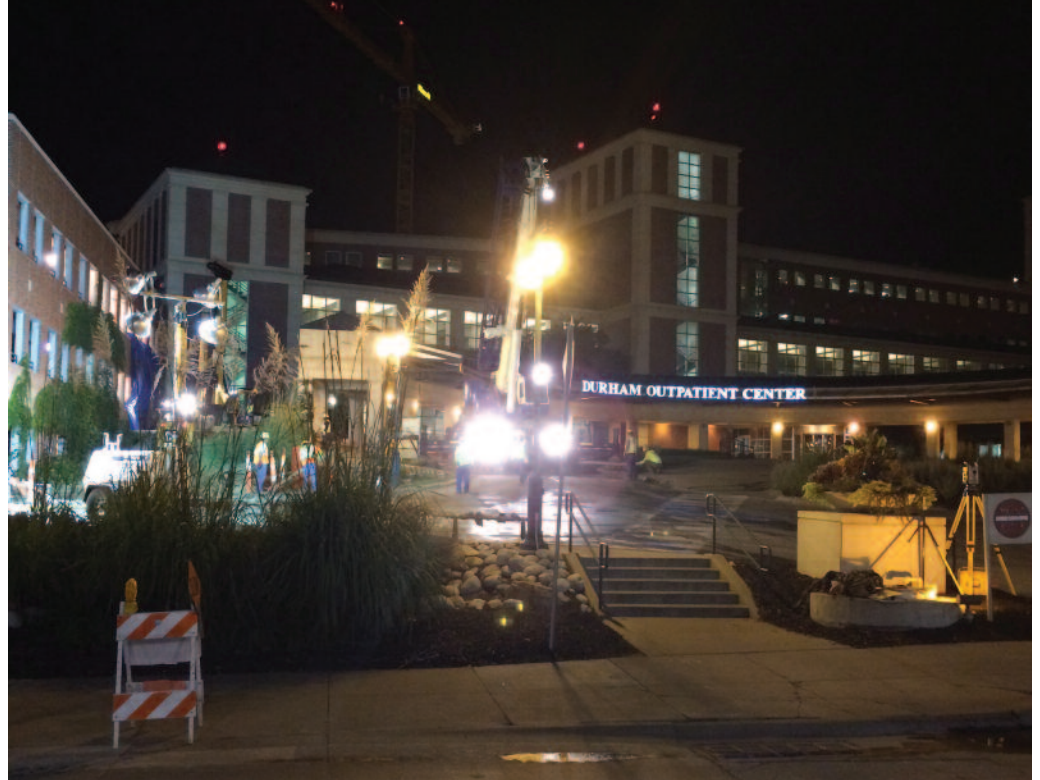
Low headroom nightwork was required at the front entrance.

project specifications required a concrete mixed design with a minimum 28-day compressive strength of 4,000 psi. To achieve both