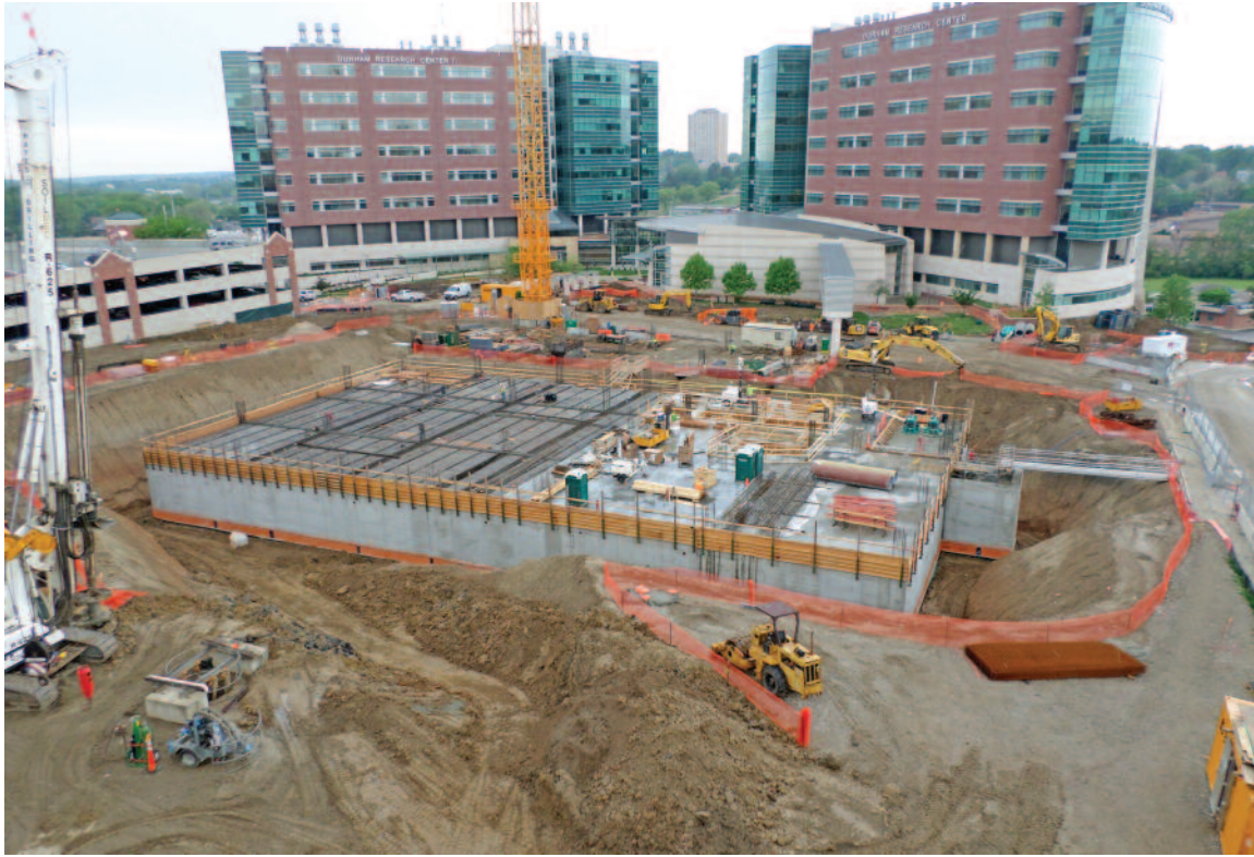
Drilling of main level shafts.

strength and workability, the mix design incorporated the use of fly ash, a water reducing/retarding admixture, and a high range water reducer (a superplasticizer to provide workability during concrete placement). To assure a quality product, approximately 10% of the drilled shafts (20 each) were tested using the Crosshole Sonic Logging test method, where no defects or integrity issues were found.