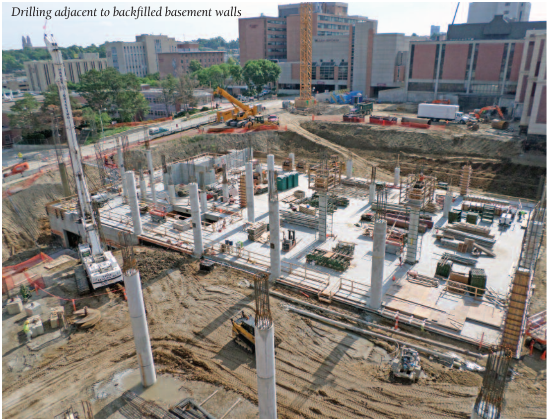
Drilling adjacent to backfilled basement walls

Although there were minimal weather-related delays to the overall schedule, the bitter cold temperatures during the winter